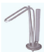
Stainless Steel Heating Element